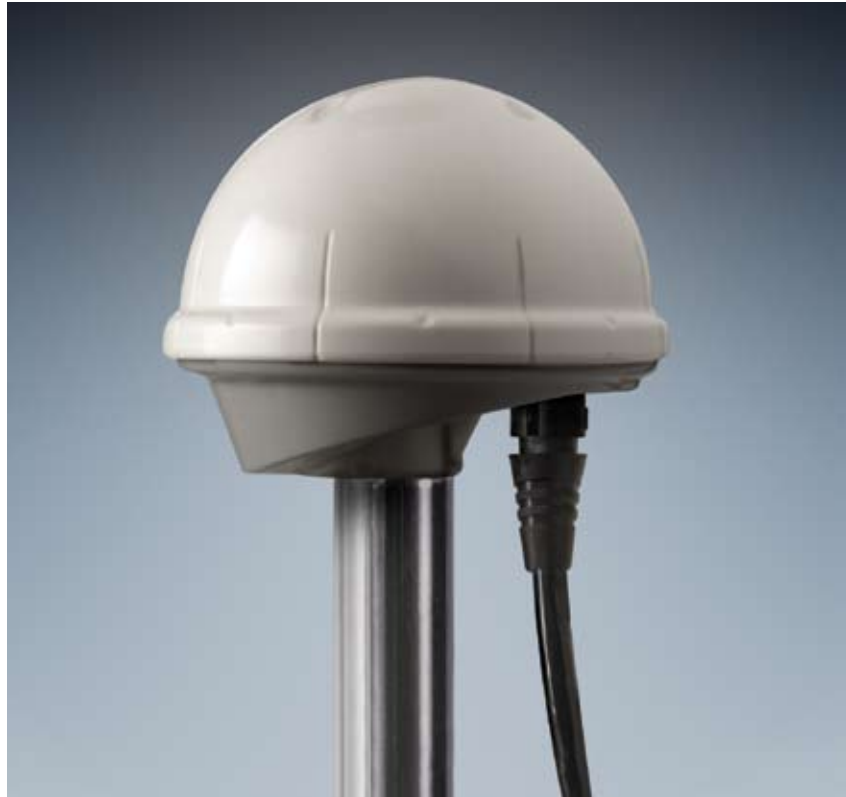
The Acutime Gold is the premier time source for synchronization of wireless networks.

Once power is applied, the Acutime Gold automatically tracks satellites and surveys its position to within meters. It then switches to overdetermined time mode and generates a pulse-per-second (PPS) output synchronized to UTC within 15 nanoseconds (one sigma), outputting a time tag for each pulse. The Acutime Gold GPS smart antenna's T-RAIM (Time-